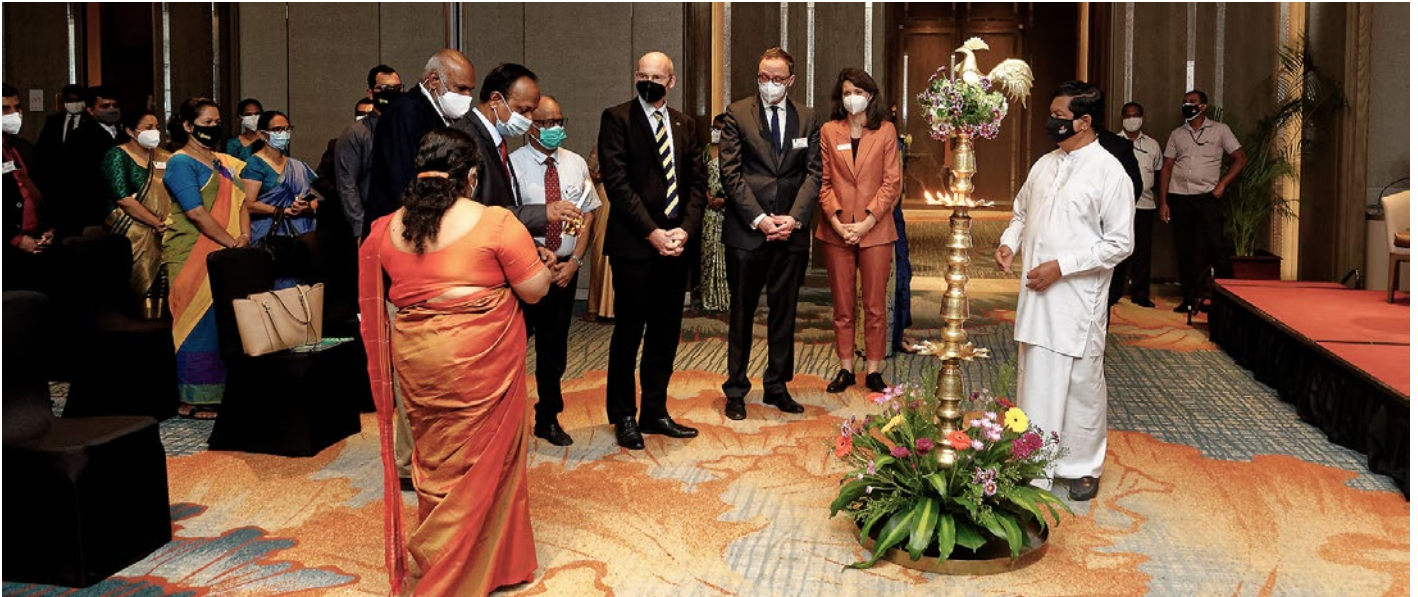
The opening ceremony of the regional office in Sri Lanka took place on January 27, 2022 in Colombo together with IPD and its partner organization EDB.